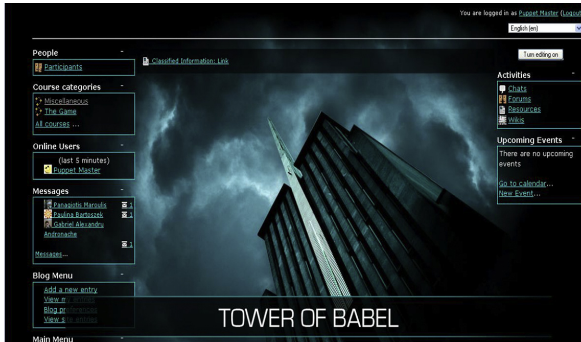
Fig. 2. The Tower of Babel theme within the ARG.